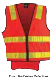
Fluoro Red/Yellow Reflectives